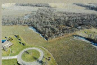
TRACT 2 - 7.0 +/- ACRES