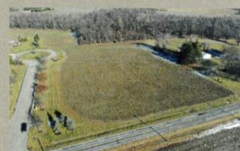
TRACT 4 - 3.5 +/- ACRES

TRACT 1 - 3,796 SQ FT CUSTOM BUILT HOME FEATURING 3 BEDROOMS, 2 FULL BATHS & 2 ½ BATHS, 2 CAR ATTACHED GARAGE, IN-GROUND POOL, 40 X 60 BUILDING, ALL SITTING ON 24.0 +/- ACRES!