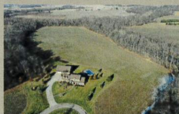
TRACT 1 - 24.0 +/- ACRES

Auction To Be Held @ Krueckeberg Auction Complex - 815 Adams Street Decatur, IN 46733