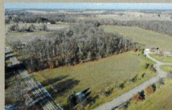
TRACT 3 - 9.3 +/- ACRES